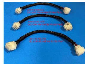
Cableserv 9 Pins to 12 Pins connector adaptors